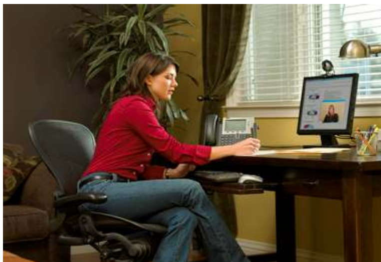
Figure 1. Millions of Knowledge Workers Telecommute from Home

Finally, the rise of outsourcing and the networked virtual organization among SMB and medium-sized businesses—that concentrate on their core responsibilities and partner with other entities to complete the “value chain”—make it imperative that project team members be able to communicate easily and transparently across organizations.