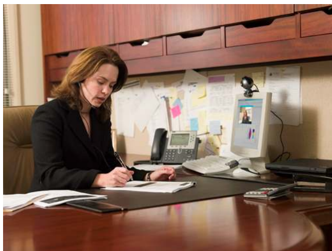
Figure 4. Cisco Unified Communications Enables More Effective, More Secure, More Personal Communications